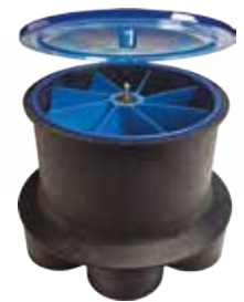
In-floor Cleaning Systems