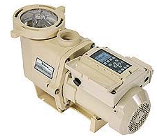
Variable Speed Pumps