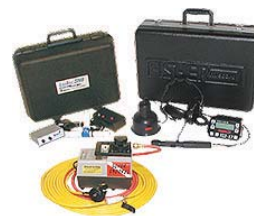
Leak Detection & Repair