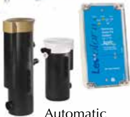
Automatic Water Fillers

At HornerXpress® Worldwide, we believe we can make a difference to our planet and our pockets by choosing the most energy efficient and environmentally friendly equipment on the market.