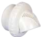
Water Circulation Enhancers