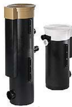
Automatic Water Fillers

At HornerXpress® Worldwide, we believe we can make a difference to our planet and your pockets by choosing the most energy efficient and environmentally friendly equipment on the market.