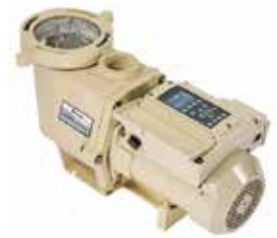
Variable Speed Pumps