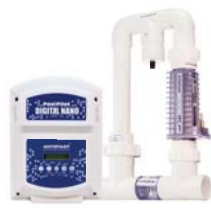
Salt Chlorine Generators