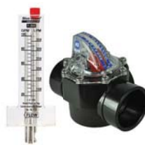
Flow Meters/Check Valves