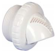
Water Circulation Enhancers