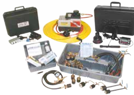
Leak Detection & Repair