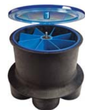
In-floor Cleaning Systems