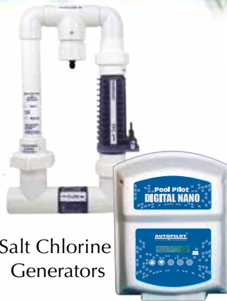
Salt Chlorine Generators